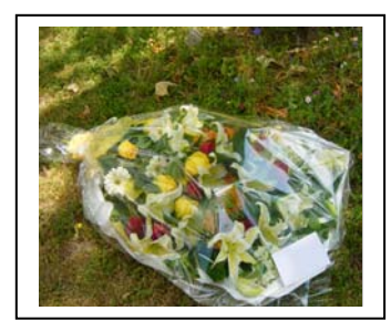
Flowers from IASI, Alain's Funeral, June 23, 2006

"They are not dead who live in the lives they leave behind. In those whom they have blessed they live again."