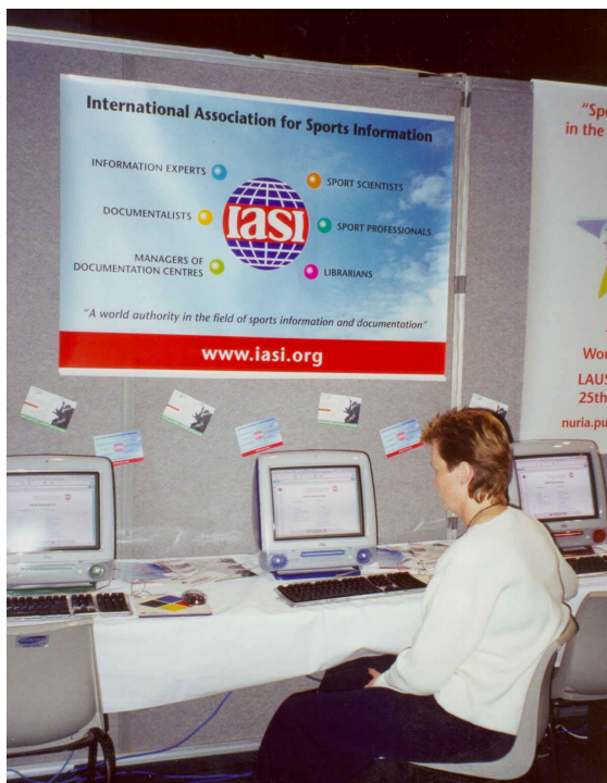
Setting up the Internet Cafe

A full report on the planning, setup and operation of the IASI Internet Café will be presented at the 2001 IASI Congress.