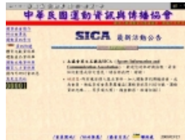
◀ official web site of the SICA

National College of Physical Education and Sports 250 Wen Hua 1st Rd. Kweishan, Taoyuan 333 Taiwan Tel: 3-396-0689, and Fax: 3-328-0592