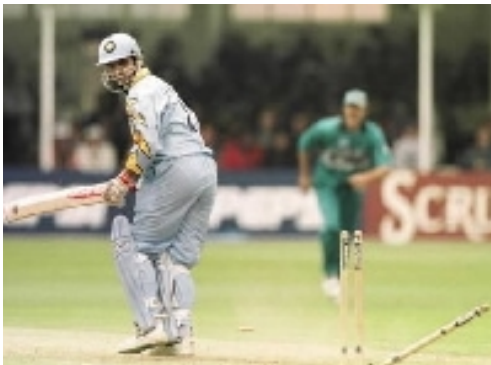
▲ Cricket – the only sport with all kinds of records and information are available in India.

Except for cricket for which all kinds of records and information are available, the national sports federations, public libraries, schools and colleges, and even the national Olympic Committee have not kept records of India's performance in sports. Some enthusiasts keep track of statistics for a particular sport. But even these individuals do not number more than a dozen or so.